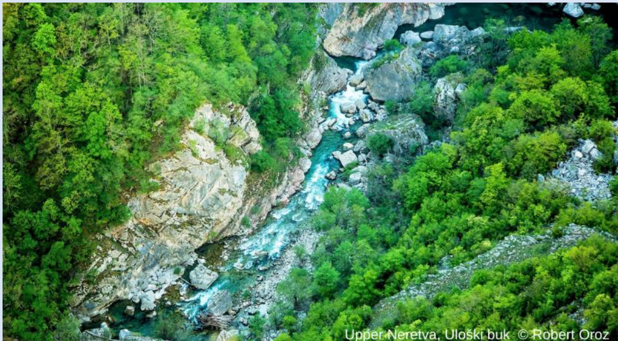
Upper Neretva, Uloški buk