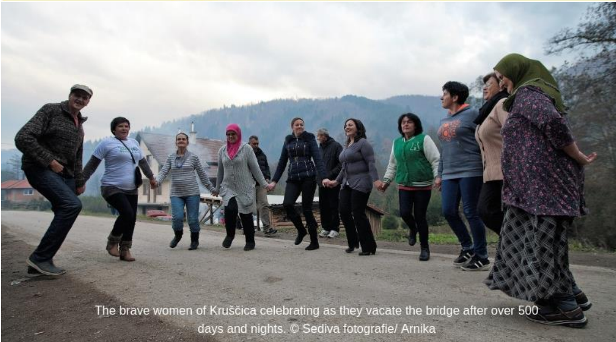
The brave women of Kruščica celebrating as they vacate the bridge after over 500 days and nights.

Victory for the "Brave women of Kruščica"! Shortly before Christmas we received good news for Balkan rivers: On December 14 th , the women of Kruščica in Bosnia and Herzegovina won a crucial court case. The permits for the construction of two hydropower plans have been cancelled; the dams must not be built. The women of Kruščica were able to vacate the bridge after over 500 days and nights of peaceful protests. MORE