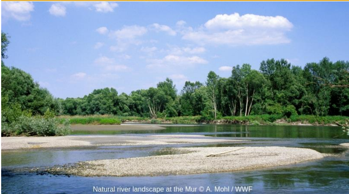
Natural river landscape at the Mur

Success for Mur! In February, the Slovenian Minister of the Environment Jure Leben presented a draft regulation to stop the eight planned hydropower projects along the Slovenian stretch of the Mur river, a decision supported by 100 scientists . This brings the Minister considerably closer to his promise to protect the free-flowing Mur for future generations. Bravo! MORE