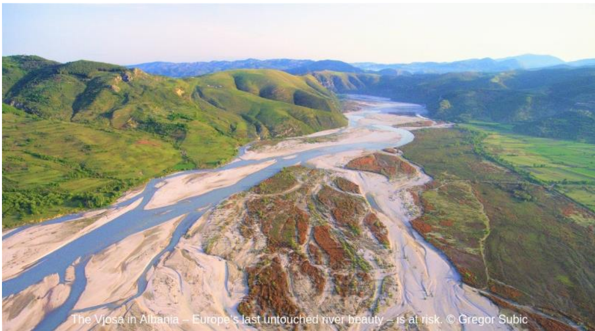
The Vjosa in Albania – Europe's last untouched river beauty – is at risk.

Bern Convention opens case-file against Albania! In early December, the Standing Committee to the Convention responded to our complaint and opened proceedings against Albania. The government in Tirana is now called upon to suspend all hydropower projects on the Vjosa river, since these pose an imminent danger to the unique ecosystem. MORE