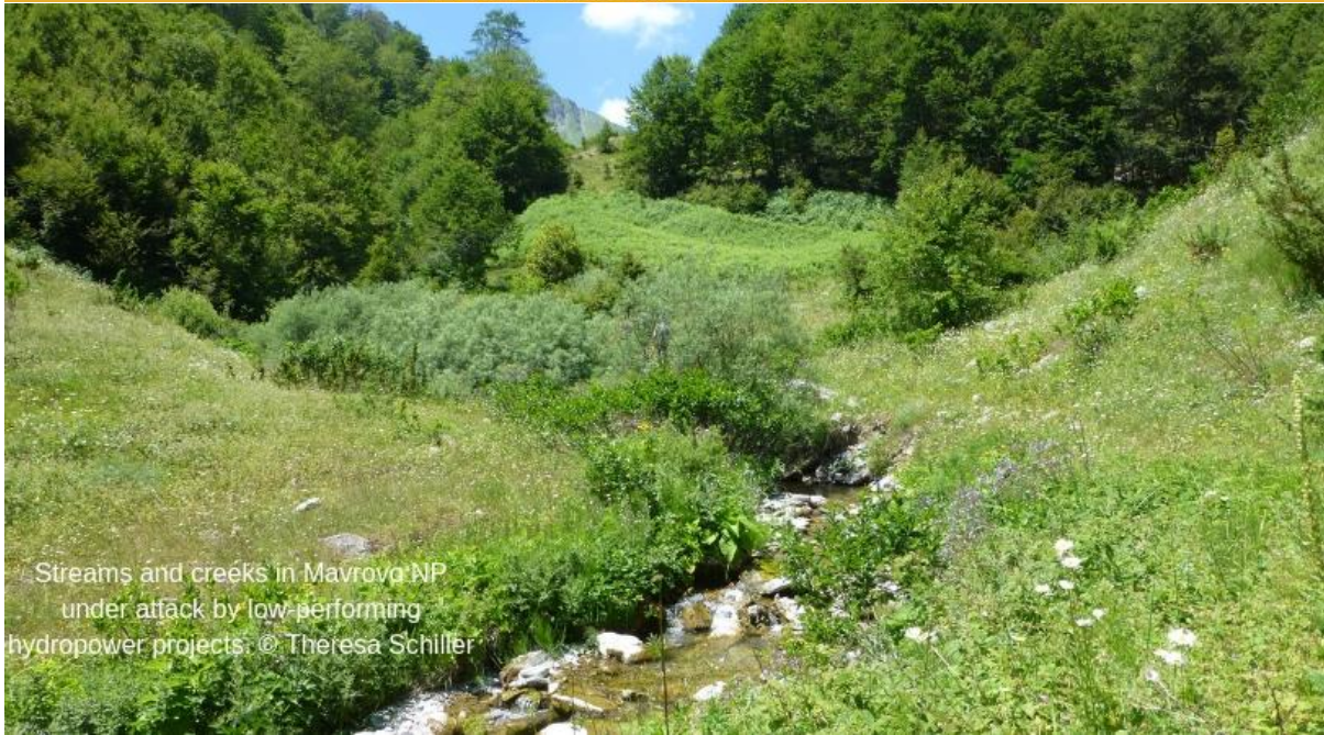
Streams and creeks in Mavrovo NP under attack by low-performing hydropower projects.

Fight for Mavrovo National Park continues! The big fight for Mavrovo National Park in North-Macedonia continues: the Zirovnicka river, one of the most important tributaries of Radika river, is at stake. Local communities in Zirovnica are dependent on this river as it constitutes their water supply and strongly opposes the two planned hydropower projects. MORE