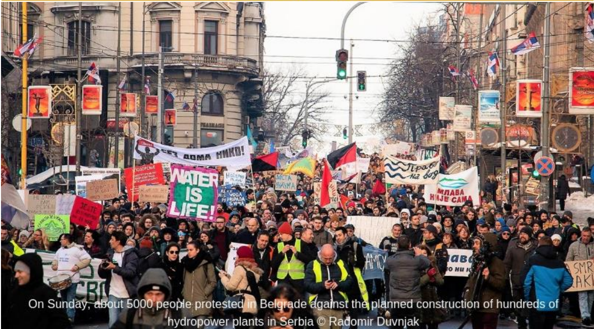
On Sunday, about 5000 people protested in Belgrade against the planned construction of hundreds of hydropower plants in Serbia

Protest in Serbia: We don't give you our rivers! In January, around 5,000 people took to the streets in Belgrade to protest against the sell-off of the rivers in Serbia, particularly against the planned construction of hundreds of hydropower projects. More than 850 hydropower plants are officially planned in Serbia, about 200 of which within nature reserves such as national parks, nature parks, etc. MORE